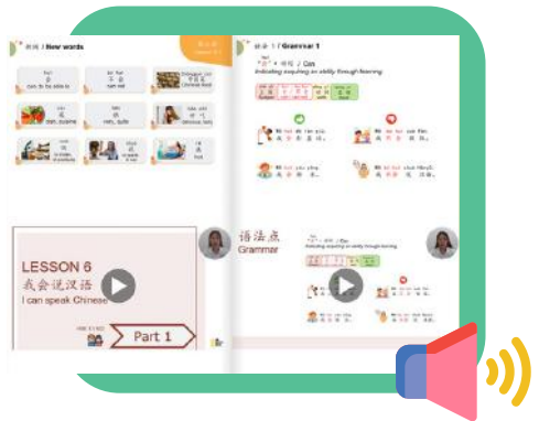
Ebook with audio