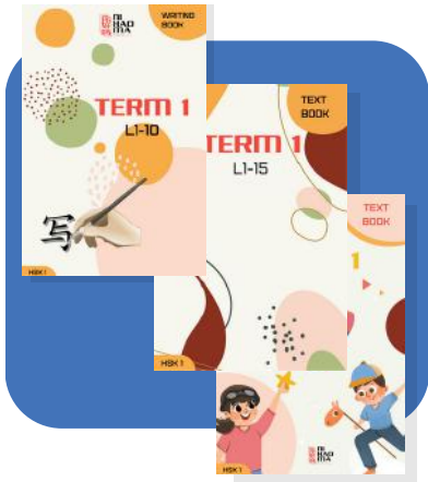
Textbook & writing book